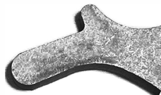
1 1/4 inch Chap Guard Shank