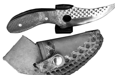
Rasp Knife Knife Sheath