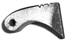
1 inch Roper Shank