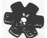
6 Point Rowel